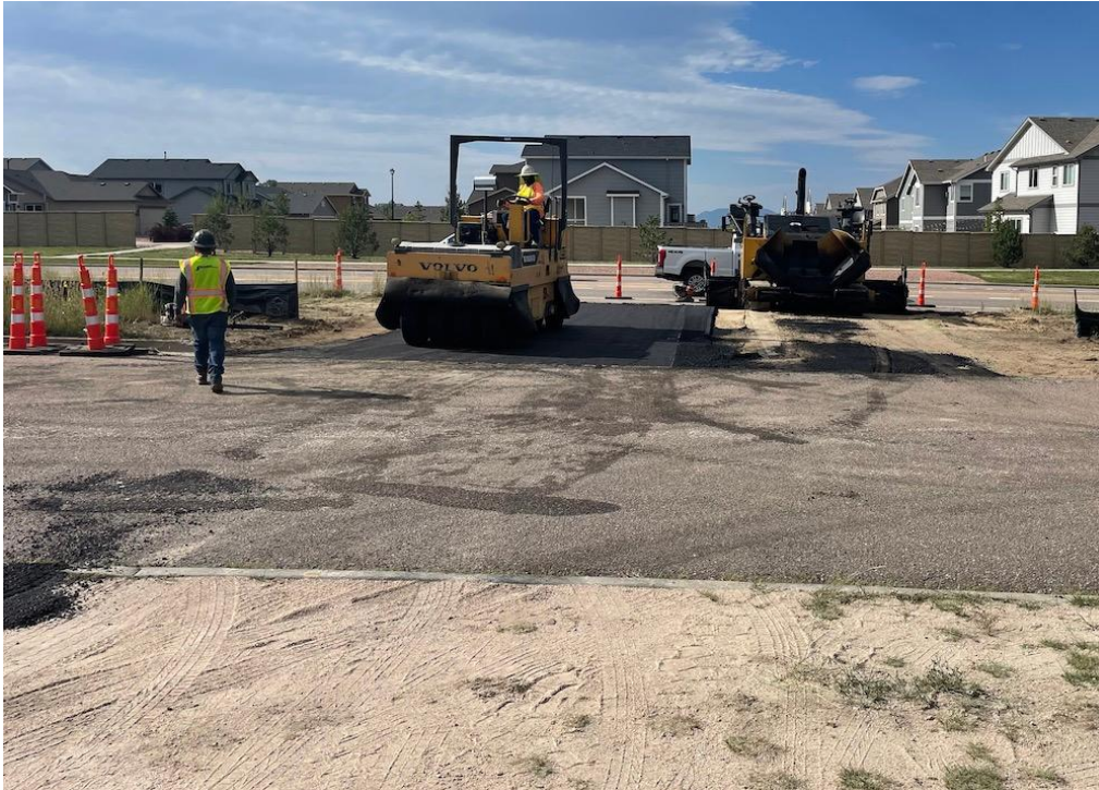
Paved temporary access from Hwy 105 onto Village Ridge Point under construction.